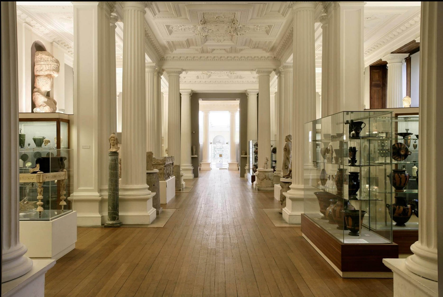
The Greek & Roman Gallery prior to the 2009 refurbishment